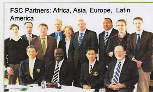
FSC Partners: Africa, Asia, Europe, Latin America